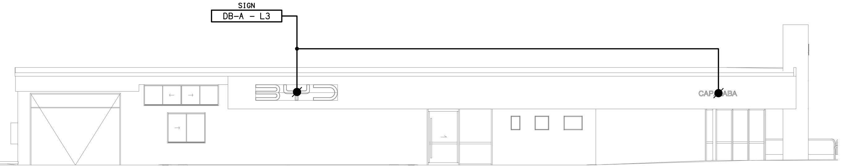
SMITH STREET EXTERNAL BUILDING ELEVATION SCALE 1:100